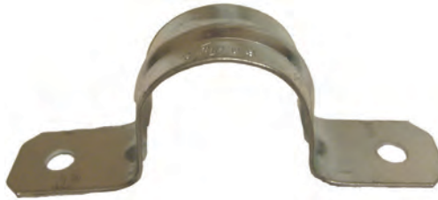
Two Hole Straps