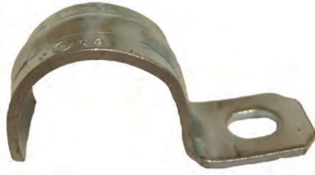
One Hole Straps